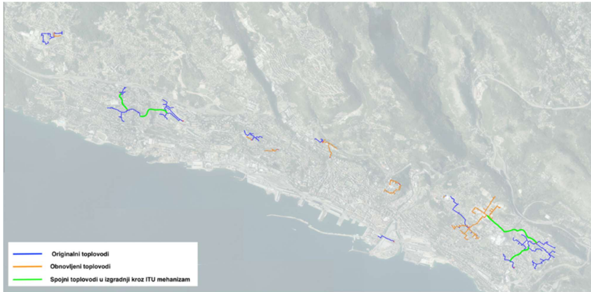
Figure 1 Existing DHS in Rijeka